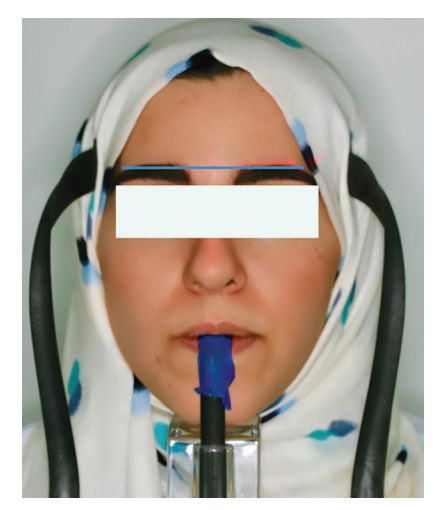
Fig. 1: The true horizontal was established by aligning the face so that the interpapillary line (blue) was parallel to the laser beam projecting on the face (red). The blue strip was a tangent line showing the parallelism of the interpapillary space to the laser beam

and applied to the collected panoramic radiographs. The evidence was most robust regarding the criteria of ectopic/impacted maxillary canines, and the adopted criteria are summarized in Table 1.<sup>25,26</sup> Ectopic mandibular canine features or criteria were significantly less prevalent in the literature, yet two studies suggested several criteria that were relatively similar to the maxillary canine criteria, and these are summarized in Table 1.<sup>27,28</sup>