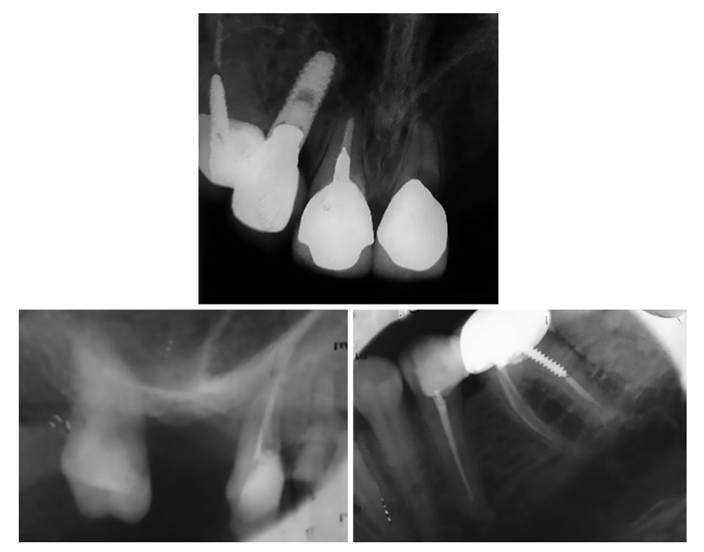
Fig. 1: Some samples of radiographs

A total of 140 subjects, aged 18 to 60 years with a mean age of 32.63 \pm 12.25 participated in the study. The prevalence of extractions in the population was 21.5%. This was more