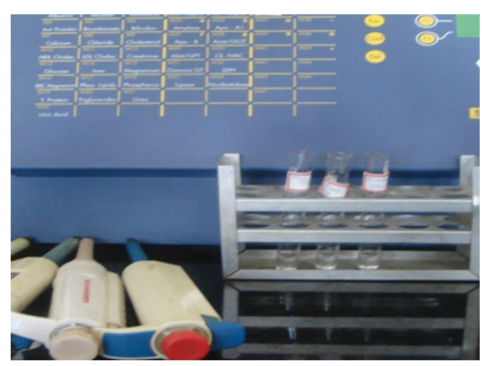
Fig. 2: Semiautomated analyzer