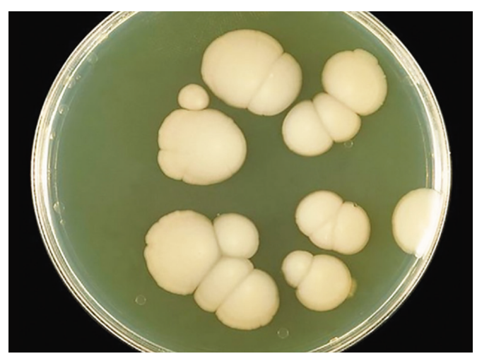
Fig. 4: Candidal colonies in SDA medium

Dentists can counsel their patients with diabetes about improving glucose regulation, maintaining oral and nutritional health,