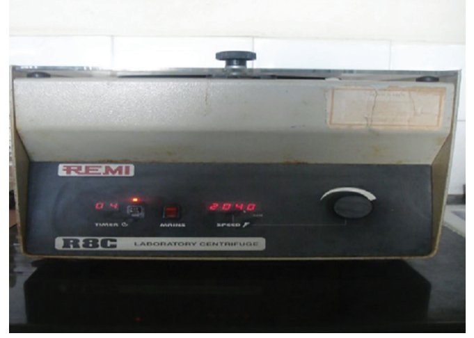
Fig. 1: Centrifuge machine

In controlled diabetics, a highly significant correlation (p < 0.01) was found between mean blood and salivary glucose levels and mean blood glucose levels and colony forming units of Candida.